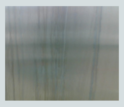
Stainless Steel Sheet Fabrication Prior to Application

Specially blended for stainless steel applications with superior and powerful cleaning action. High quality surfactants create excellent surface wetting, dispersing and removing most common fabrication greases and soil. Active ingredients preferentially attack surface contamination leaving a sharp clean uniform finish.