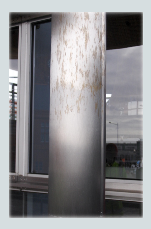
This column showed signs of corrosion shortly after installation. The lower area has been treated with Cleaner 61.

Carried out by spray with either the trigger spray supplied or a pump action spray device, the product is applied liberally directly to surface fascia's, ensuring that all areas are fully covered and wetted. In severely soiled conditions or when application is carried out on used or old fabrications, abrasion with a ScotchBrite pad or similar is advised, although care must be taken not to damage the existing surface finish. Always abrade in the same direction or a direction which compliments the component or fabrication.