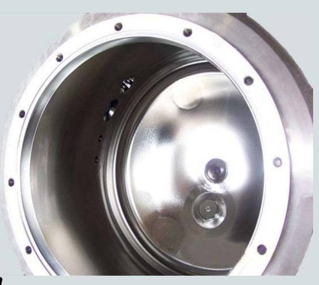
Stainless Steel Cleaner 61 is often used as a pretreatment prior to electro polishing with Willowchem 90 / 91 Electrolyte

Note:- It is always recommended to trial a test coupon first to ensure compatibility.