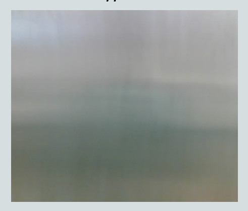
Stainless Steel Sheet Fabrication After Application

Willowchem Stainless Steel Cleaner 61 is supplied ready to use and requires no dilution. It is suitable for a wide range of applications with corrosion resistant alloys.