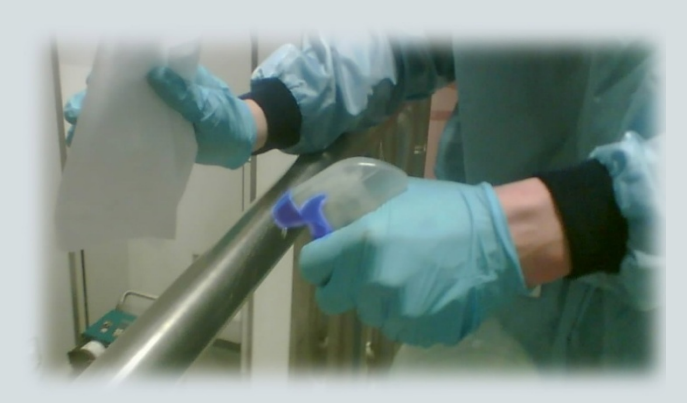
Easily applied and on new fabrications, active ingredients require no scrubbing, just spray it on, wait a short time, wash off and your stainless fabrication is given a clean crisp new look.